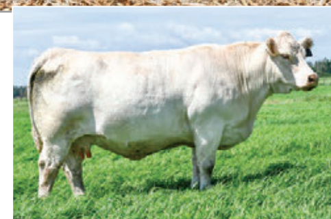
LJC ADA 3A - DAM OF LOT 34