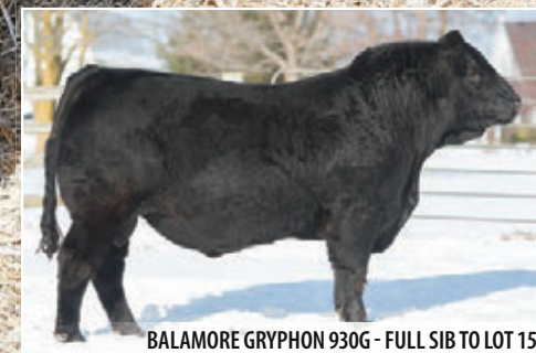
BALAMORE GRYPHON 930G - FULL SIB TO LOT 15