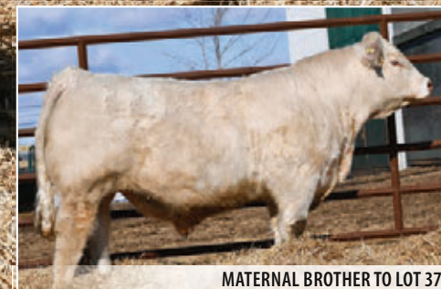
MATERNAL BROTHER TO LOT 37