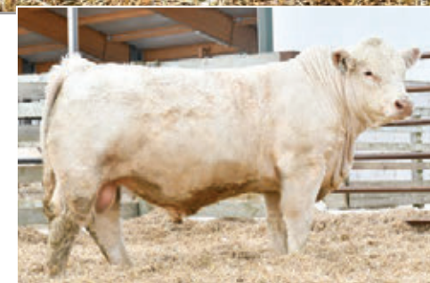
BALAMORE GODZILLA 925G - MATERNAL SIB TO LOT 30