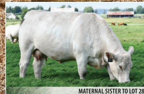
MATERNAL SISTER TO LOT 28