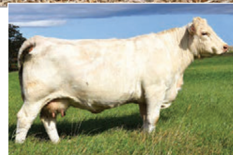
CEDARDALE MISS 55B - DAM OF LOT 36