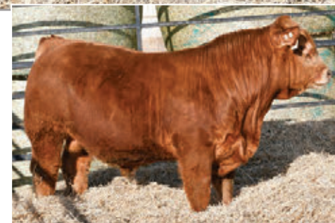
BALAMORE JETTA 131J - FRONT VIEW