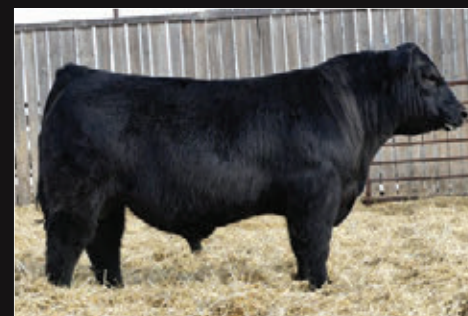
DAINES INSIGHT 27E