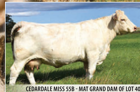
CEDARDALE MISS 55B - MAT GRAND DAM OF LOT 40