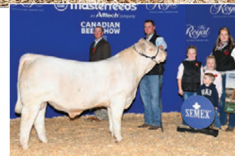
CEDARDALE GUNNER 99G - FULL SIB TO DAM OF LOT 35