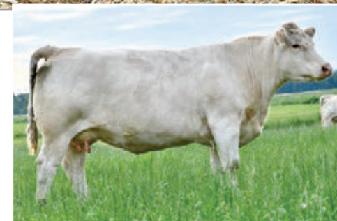
STEPPLER MISS 208C - DAM OF LOT 31