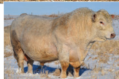
BALAMORE DRIFTWOOD 196D - MAT BROTHER TO LOT 27