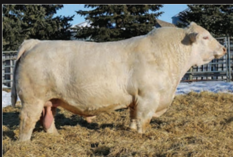
ELDER'S BLACKJACK 788B