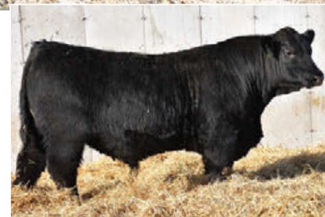
MATERNAL BROTHER TO LOT 47