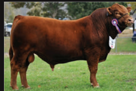
BIRUBI KAISER K140

└ RPY PAYNES ELVIS 34X WGL ABERCROMBIE 35A └ WGL XAMINER 7X