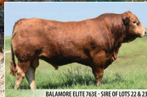
BALAMORE ELITE 763E - SIRE OF LOTS 22 & 23