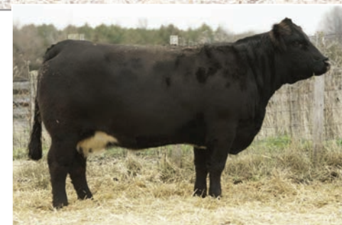
TMF MISS 612W - MATERNAL GRAND DAM OF LOT 10