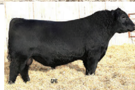
PLEASANT VALLEY LUTE 1207 - SIRE OF LOT'S 48 & 49