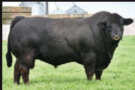
BALAMORE ENDEAVOR 701E

└ WULFS YONKERS K682Y AFTER HOURS CELEBRITY └ AFTER HOURS YOGI