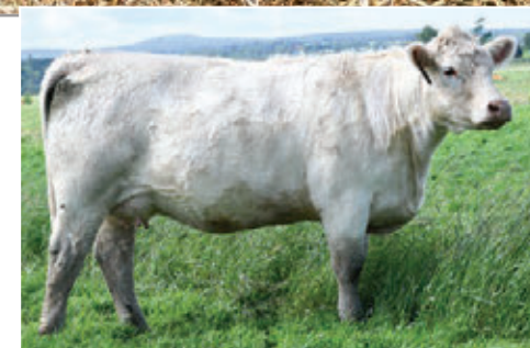
BALAMORE FANTA 806F - DAM OF LOT 38