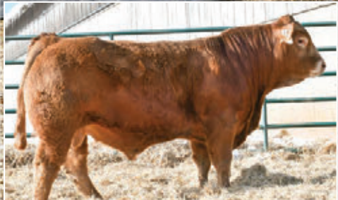
BALAMORE GOLD RUSH 927G - MATERNAL BROTHER TO LOT 19