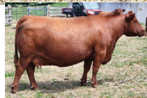
DAM OF LOT 51