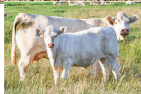
DAM AND MATERNAL SISTER TO LOT 42