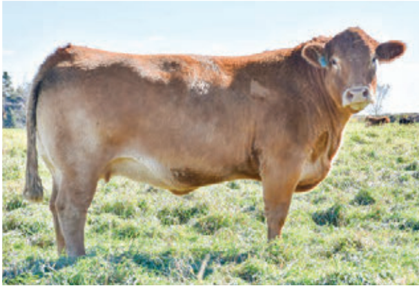
BALAMORE BO PEEP 419B - MAT GRAND DAM OF LOT 52