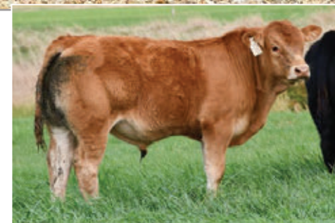
LOT 2 - SUMMER 2020