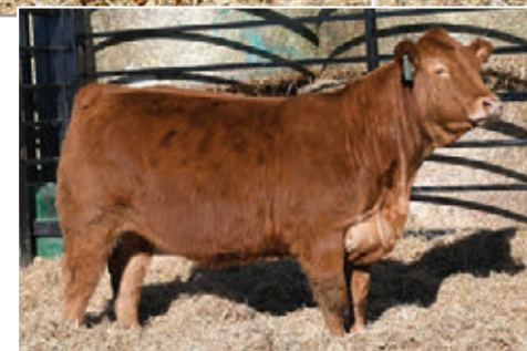
MATERNAL SISTER TO LOT 21