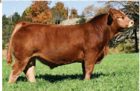
BALAMORE HALIFAX 019H - MATERNAL BROTHER TO LOT 19