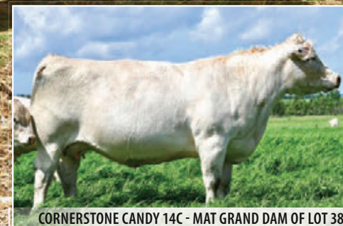
CORNERSTONE CANDY 14C - MAT GRAND DAM OF LOT 38