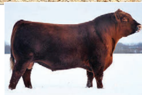
SIRE OF LOT 50