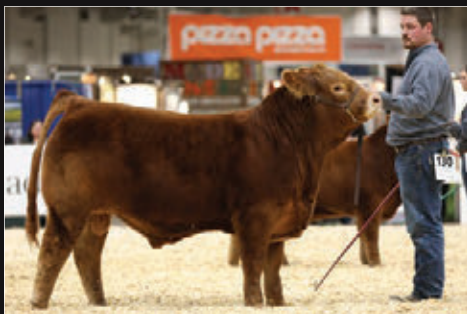
AFTER HOURS GAMBLER 131G