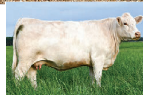
BALAMORE DAHLIA 46D - DAM OF LOT 29