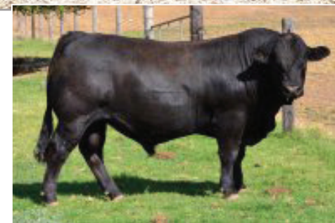
MARYVALE FEDERA 0067F - SIRE OF DAM OF LOT 16