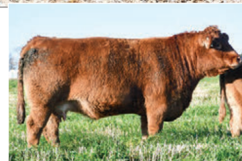
637D - DAM OF LOT 7