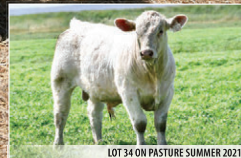
LOT 34 ON PASTURE SUMMER 2021