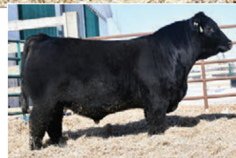
FULL BROTHER TO LOT 49