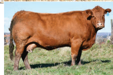
MISS 151D - DAM OF LOT 11