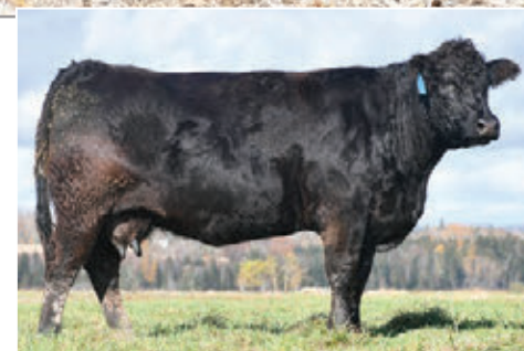
MISS TMF 1E - DAM OF LOT 6