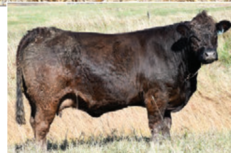
TMF MISS 302A - MATERNAL GRAND DAM OF LOT 3