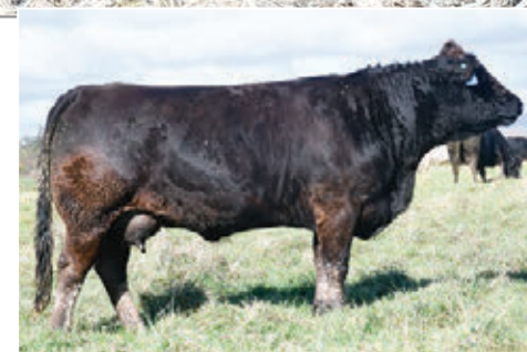
CLARKS EXTRAVAGANT KISS - DAM OF LOT 13