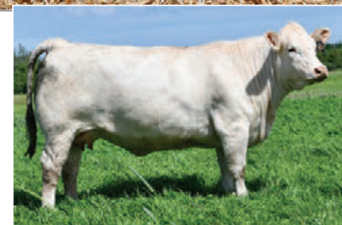
BALAMORE FARRAH 838F - DAM OF LOT 40