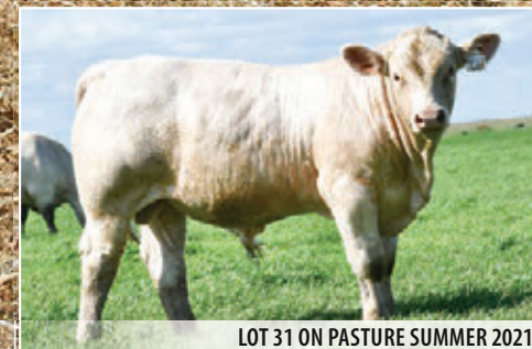
LOT 31 ON PASTURE SUMMER 2021