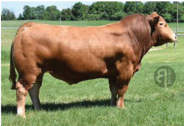
B BAR GRANITE 57C - SIRE OF LOT 53

Videos of Lot 52 and 53 are available @ www.cattlevids.ca