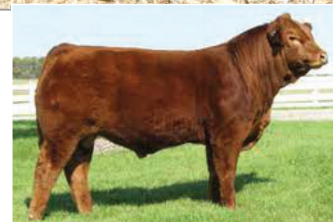
TMF WESTWOOD 505W - SIRE OF DAM OF LOT 14