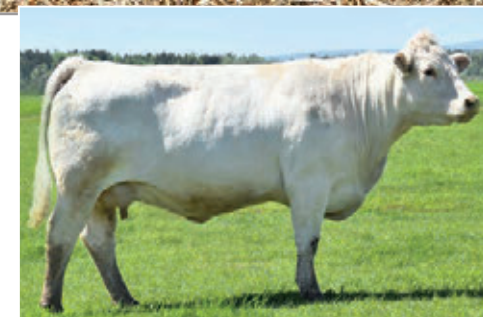
CEDARDALE MISS 105C - DAM OF LOT'S 32 & 33