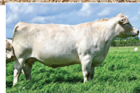
CORNERSTONE CANDY 14C - DAM OF LOT 37