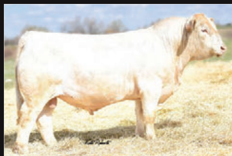
LT RANSOM 8644

└ SVY AD INVINCIBLE P 748T SVY STARSTRUCK 8X └ SVY STARSTRUCK 559P