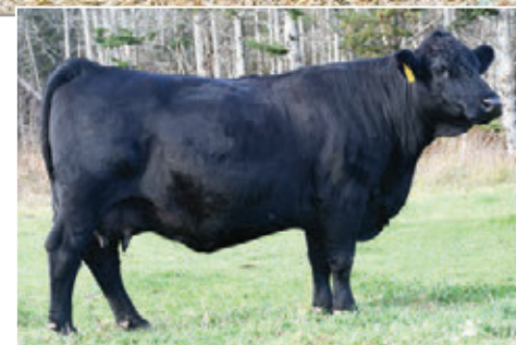
MRC MISS UREIKA 48D - DAM OF LOT 45