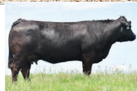
BALAMORE CHARLOTTE 577C - DAM OF LOT 17