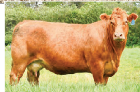
BALAMORE BARBARA 423B - DAM OF LOT 22