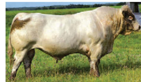
STEPPLER JACKSONVILLE 335Z - SIRE OF DAM OF LOT 39