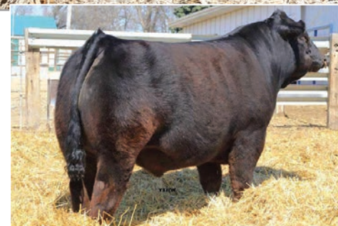
WULFS COMPLIANT K687 - SIRE OF DAM OF LOT 9