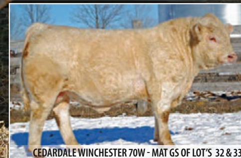
CEDARDALE WINCHESTER 70W - MAT GS OF LOT'S 32 & 33