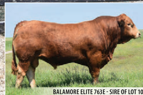
BALAMORE ELITE 763E - SIRE OF LOT 10