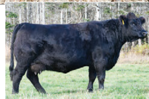
BALAMORE EMERALD 703E - DAM OF LOT 44