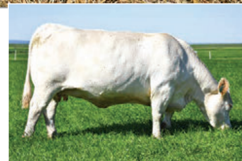
CEDARDALE MISS 3B - MATERNAL GRAND DAM OF LOT 25