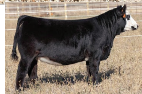
DOUBLE BAR D SUSE 438F - DAM OF LOT 46