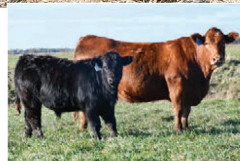
DAM AND FULL BROTHER TO LOT 5 (SUMMER 2021)