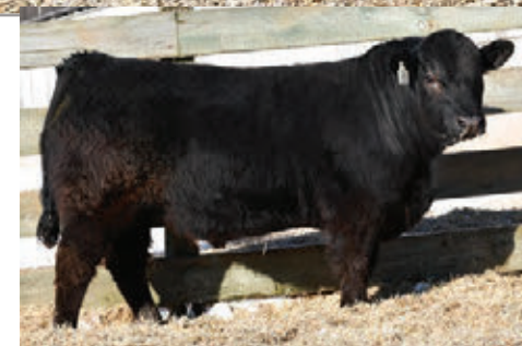
MATERNAL BROTHER TO LOT 24