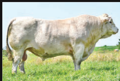
LT VIKING 8156 PLD

└ LT BLUE VALUE 7903 ET LT SHEILA 337 PLD └ LT MISS BREEZY 524