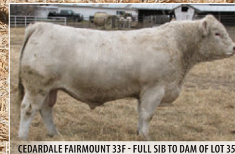
CEDARDALE FAIRMOUNT 33F - FULL SIB TO DAM OF LOT 35