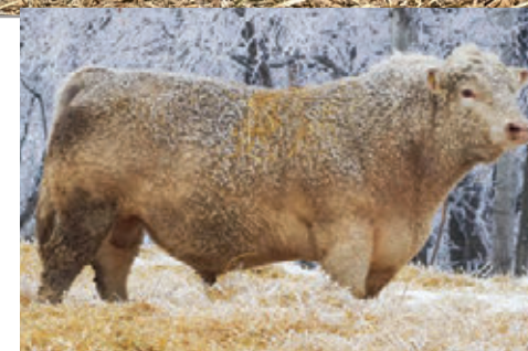
SPARROWS COPENHAGEN 210Z - MAT GRAND SIRE OF LOT 26