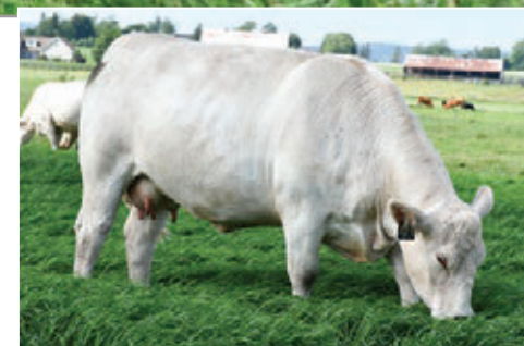
BALAMORE EXOTICA 702E - MAT GRAND DAM OF LOT 43