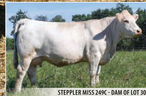
STEPPLER MISS 249C - DAM OF LOT 30