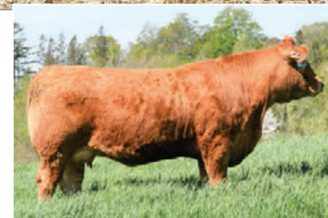
BALAMORE GOLD DIGGER 917G - DAM OF LOT 20