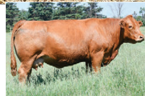
RLF 148D - DAM OF LOT 1