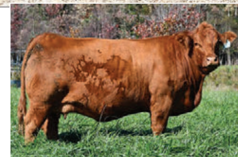
MATERNAL SISTER TO LOT 15