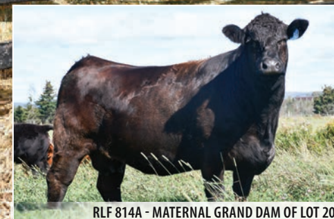
RLF 814A - MATERNAL GRAND DAM OF LOT 20