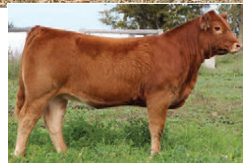
PINCH HILL FOOTLOOSE 812F - DAM OF LOT 18 AS A CALF