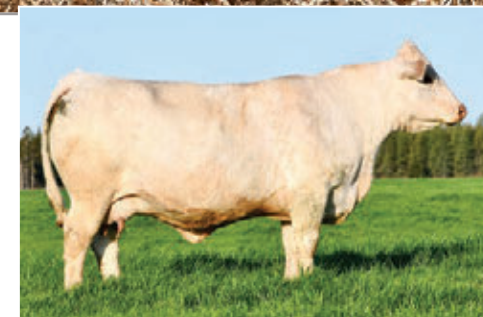
CEDARDALE MISS 45C - DAM OF LOT 28