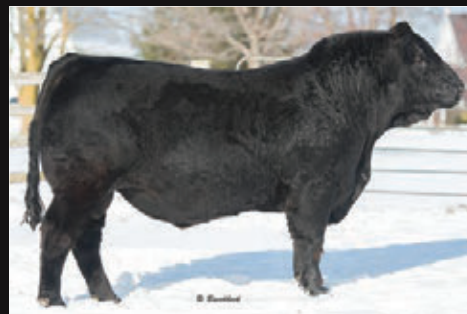
BALAMORE GRYPHON 930G

└ WULFS SPRING LOADED 3158S CLARKS AFFECTIVE KISS └ DKC UNFORGETTABLE KISS