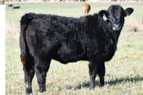
MATERNAL SISTER TO LOT 4